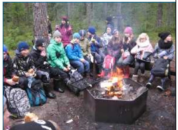
Gr 6 out at the nature school

a Peaceful Christmas and a Happy New Year!